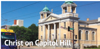
Christ on Capitol Hill

From office space, to benevolence and grants, to mentors and programming, the churches' leaderships and congregations have continuously supported East Metro job seekers in developing and achieving their employment and life goals. From the time of our inception, their support has provided a foundation for guiding 2,500+ individuals. This has blossomed into an extensive circle of volunteers, employers, higher-education institutions, nonprofits, and community members that make Daily Work what it is today.